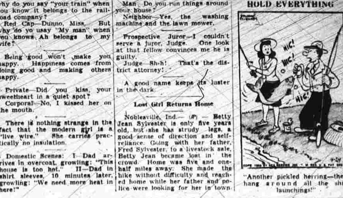
BY FRED HARMAN

FOR SALE SOFA-Lounge sofa with new light blue floral slipcover $35.00 SOFA-Lounge sofa, upholstered in Red Frizex $35.00