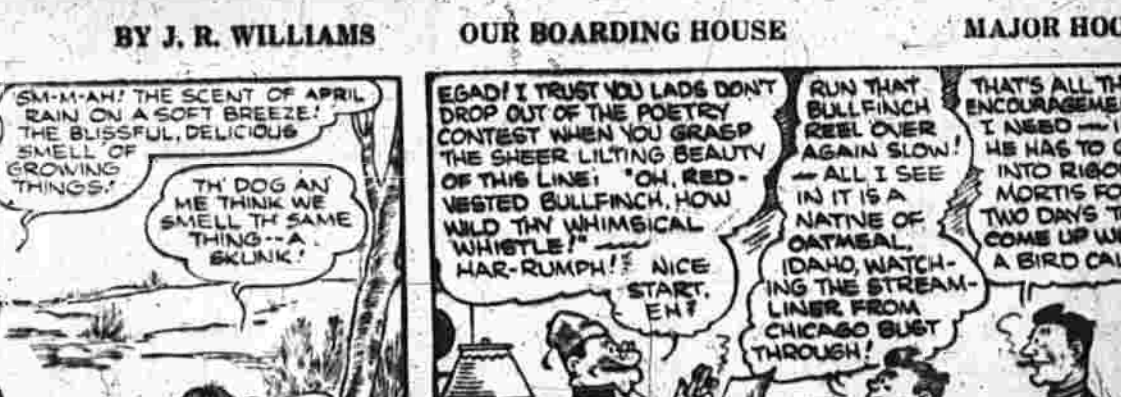
BY J. R. WILLIAMS

FOR SALE SOFA-Lounge sofa with new light blue floral slipcover $35.00 SOFA-Lounge sofa, upholstered in Red Frizex $35.00